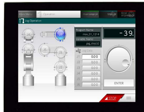
8.4-inch SVGA / XGA

Mitsubishi Electric Color TFT-LCD module with projected capacitive touch panel