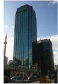
Maya Akar Center, location of Mitsubishi Electric Turkey HQ