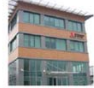
Former GTS building, location of industrial automation business

In addition, Mitsubishi Electric Turkey will support efforts to expand other Mitsubishi Electric businesses in Turkey, including those involving air conditioning and infrastructure-related business, such as satellites, elevators/escalators, electrical equipment for railcars, and power systems.