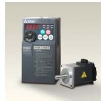
Drive unit (FR-E700EX) & sensor-less motor (MM-GKR)