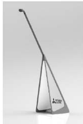
Wireless surveillance camera

Mitsubishi Electric Corporation (TOKYO: 6503) has developed a wireless network system for surveillance cameras that uses multihop technology to enable users to set up a network simply by connecting the wireless cameras using visualization software, without any need for power cords or a wired LAN.